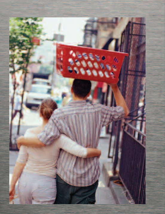
Surpassing customer expectations every day.

In addition to remarkable energy savings and durability, the Solaris line boasts a smaller footprint than other dryers of the same load capacity. That means you can fit more machines on the floor space you have and increase your revenue potential without increasing your overhead.