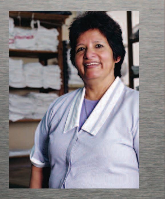
Results you can count on for the long run.

The Solaris line was unquestionably built for the demanding, round-the-clock needs of commercial operations. By creating machines with your needs in mind, ADC offers you dryers with more of what you want in terms of dependability, energy savings, drying speed, serviceability, convenience and safety.