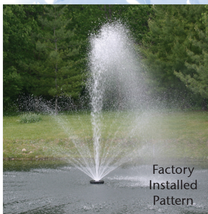
Water Lily - An eye-catching combination spray (15' @ 4,900 GPH or 82 GPM)