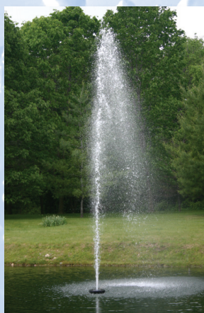
Sky Cannon - A dramatic single plume of water (15' @ 3,300 GPH or 55 GPM)