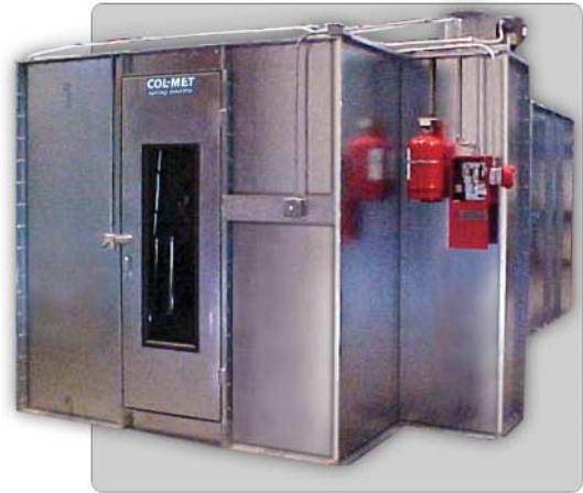
Fire suppression and controls are not included.

All cabin and plenum sections are made with 18-gauge steel. The personnel access door is prehung in heavy gauge steel galvanized frames for easy installation. Brixon™ latches are provided for the door opening. One 14" x 48" observation window is standard in all paint mix room personnel doors.