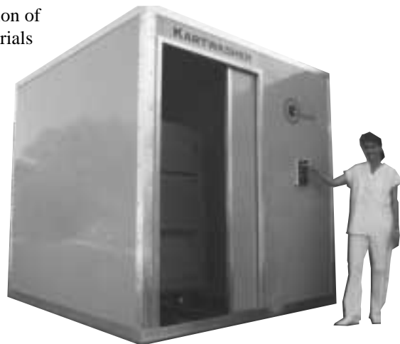
PREMIER MANUAL LOAD MODEL