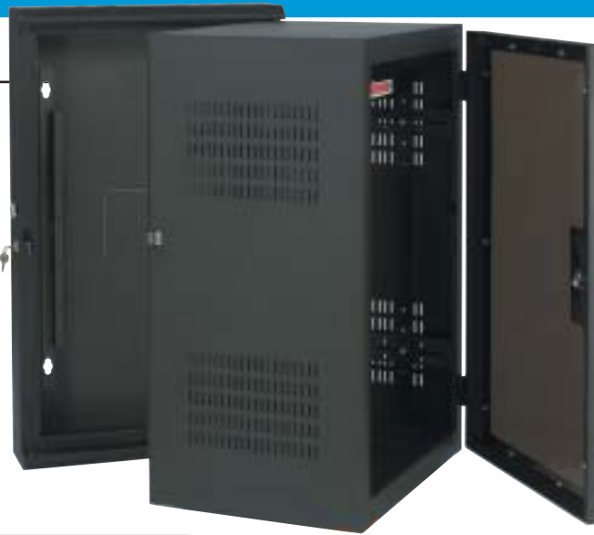
Shown with optional locking rod and optional front door.

The Raxxess sectional wall racks have been re-designed with ease of installation, security and structural integrity in mind. The SWR series is a fully welded enclosure. The back pan is reinforced at the hanging points to minimize the possibility of tear-out. Welded stiles and rails eliminate cabinet distortion while an extended bottom lip provides support for the center section during installation and use. The center section pivots on alloy steel socket pins, that thread into weld nuts on the cabinet. These pins aid during installation making it possible for one person to install the rack with just the use of a hex key. The rack is equipped with fully adjustable, 11 gauge rack rail, ventilated sides, and a variety of conduit knockouts in the top and bottom. Further, there are abundant tie off points throughout the rack. Keyed locks are standard between the rear and center sections and between the center and the optional front door. The SWR can be set up so that both the center section and door can swing left or right. For additional security a locking security rod can be added as an option. The rack is finished in durable, black powder coat.