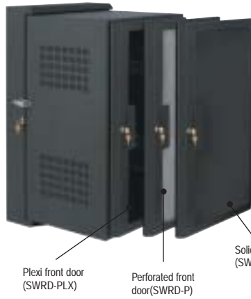
Plexi front door (SWRD-PLX) Perforated front door (SWRD-P) Solid front door (SWRD)