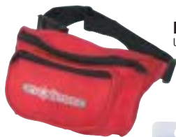
Fanny pack Used for HPSW-500 & CPSW-500

Matching bit for security screws. Not shown.