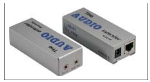
300Meters Extender Kit (AUDIO-C5EXT)

Perfect add-on to the VGA-USB2 Multi-View Presentation System! The Audio CAT5 Extender Kit allows you to send stereo audio and microphone input up to 1,000ft away from the computer using regular CAT5e cable.