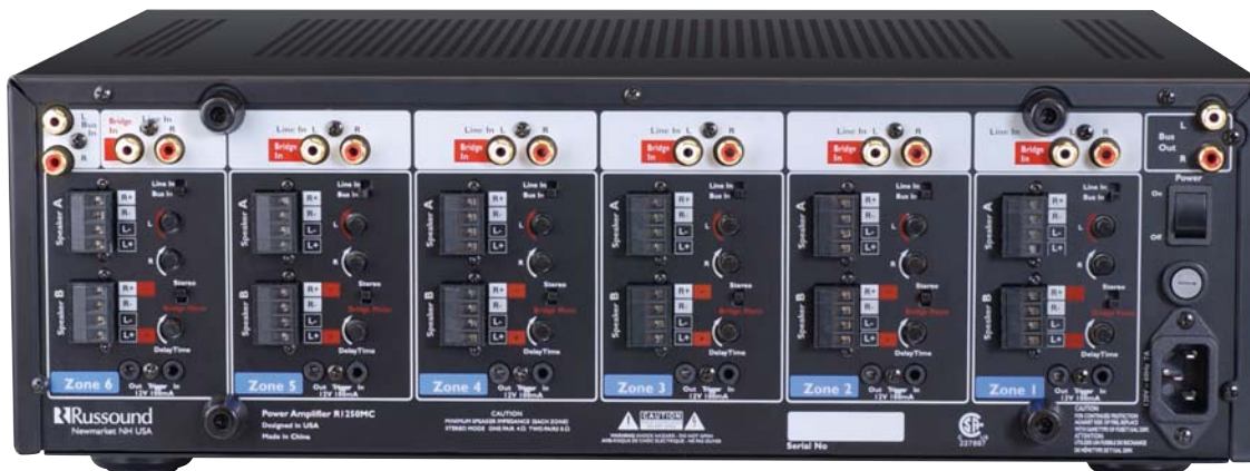
R1250MC power amplifier rear panel

Modular speaker connectors have fast yet ultra-reliable wiring. Individual 12-volt triggers, audio sensing inputs and adjustable input