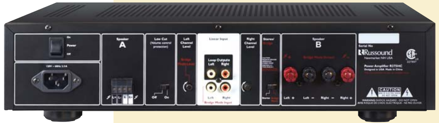
R275HC power amplifier rear panel

But we've got that, too. The R-Series amps' elegantly understated industrial design comes courtesy of Cambridge Product Design, a British firm that's been winning international industrial design awards for a quarter century and more. Their standard-width, modular-height designs look great in system shelving or built-ins, and each one (except the ultra-compact R235LS) includes rackmount conversion hardware for seamless rack integration.