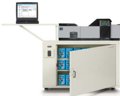
Security plus convenience. SecureVault 2000 with Workstation provides an efficient work surface for PC and other system components.

SecureVault helps prevent inefficient work stoppages by alerting operators whenever materials in inventory drop below a preset level.