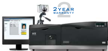
DTC550 printer/encoder shown with optional lamination module.