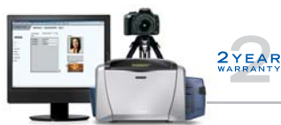
DTC400 printer/encoder shown with Fargo Asure ID software.