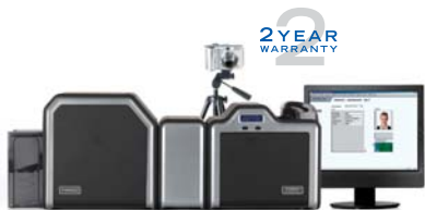
HDP5000 printer/encoder shown with optional two-sided printing and lamination modules.