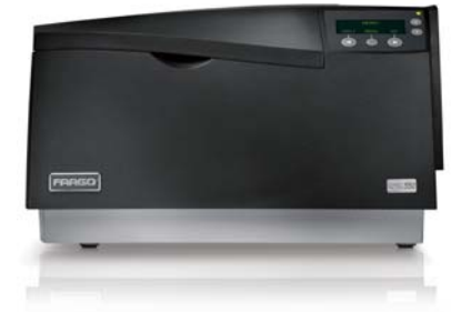
Versatility starts here. A basic DTC550 uses Fargo's Direct-to-Card technology to print full-color, single- and dualsided cards. Match specific needs with connectivity, lamination and e-card encoding options.

tection for the DTC550 and your entire card issuance system. Print Security software adds password-controlled access to the DTC550. It can notify key personnel by text message or e-mail whenever printing is attempted outside of authorized hours.