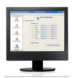
Enhanced security anywhere. Print Security software controls printer access, card issuance and authenticity from any local or networked PC.

In a networked environment, it's easy to think of the DTC550 as just another office printer. It's not. Without proper security measures, a DTC550 could be used to produce fraudulent ID cards that are indistinguishable from the real thing. That makes