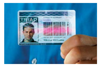
The features and flexibility of the DTC550 make it an ideal choice for card security systems that employ:

For secure ID card issuance without compromising enterprise networks, contact an authorized Fargo integrator about the Fargo DTC550 Direct-to-Card Printer/Encoder.