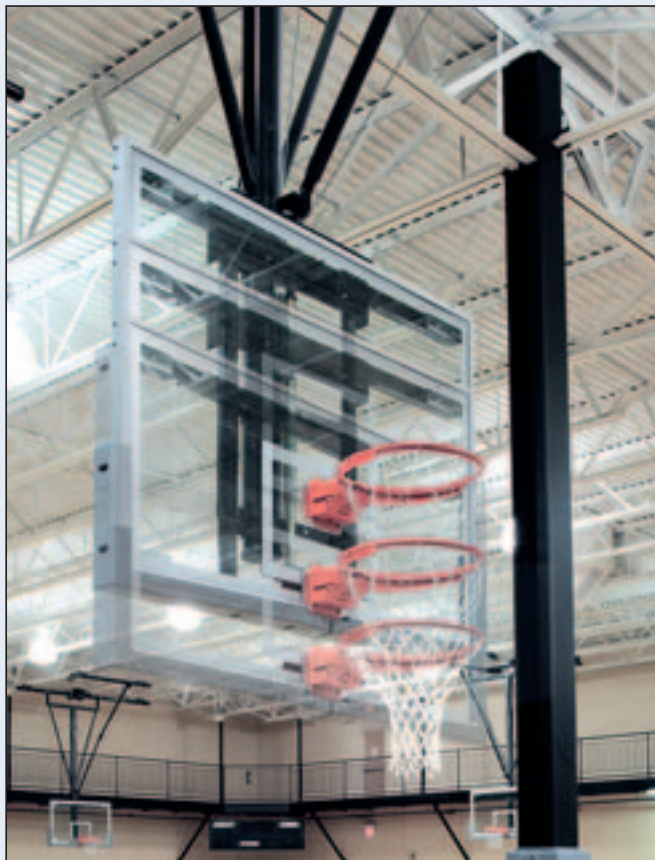
Electric height adjuster can be raised and lowered to allow 24" of travel.