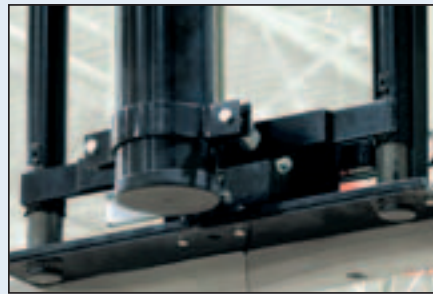
Direct goal attachment is designed to mount to virtually any style of backstop.

Manual Height Adjuster: Is operated with a removable awning-style crank handle and actuated via a \frac{3}{4} "–6 Acme threaded rod. Its actuator rod assembly is bolted in place and easily removed for conversion to electric operation.