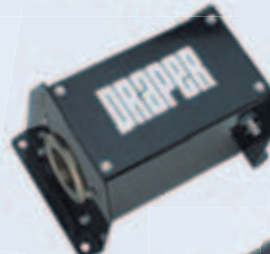
503086 Manual Winch. (Left) top view, (below) back view of winch.