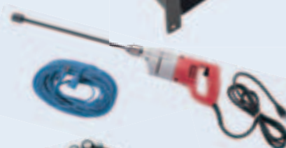
A0490 electric operator for Manual Winch and optional 50' power cord

A compact, heavy-duty, reversible electric operator for use with manual winch 503086. Complete with an 18" extension adaptor. Makes the operation of manual winch backstops a quick, easy task. Optionally available with 503048 50' Power Cord and 503047 Portable Storage Case.