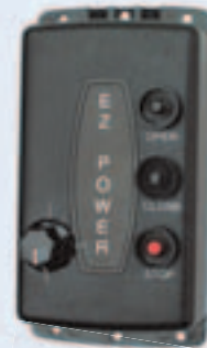
503023 Wireless Remote Control

Eliminate complicated, expensive wiring, wall boxes and individual key switches with a radio control system. The EZ POWER portable hand held transmitter is capable of operating up to 27 individual one horsepower electric motor winches. Power supply for the hand held transmitter is a standard 9-volt battery. Operating range is at least 125'. Requires item 503020, a 9-station transmitter, or 503021, a 27-station transmitter.