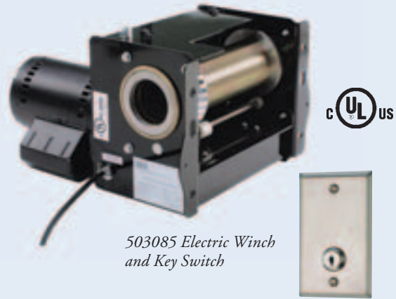
503085 Electric Winch and Key Switch

A one-horsepower motorized winch operates our EZ FOLD basketball backstops. Our winch delivers 1000 lbs. of vertical lifting and 1500 lbs. of horizontal line pull. Designed to hold the backstop at any position when raising or lowering the backstop with the turn of a key. The cable drum is helically grooved for ¼", 7 x 19 aircraft cable. The grooves provide proper spooling of the cable and ensure excellent repeatability of stop positions. The drum is equipped with a pressure roller with torsion spring tensioning. It ensures that the cable tracks in the grooves even under slack cable conditions. The winch has a direct drive, double worm reduction system. No oil lubrication is required. Automatic limit switches control the distance of travel in either direction. Entire winch assembly is UL listed. A 3-position momentary key switch and cover plate is supplied with each motorized winch. Five-year warranty.