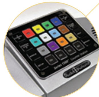
Counter stations can be configured in the field to operate up to 16 lanes, with many different combinations of colors or numbers.