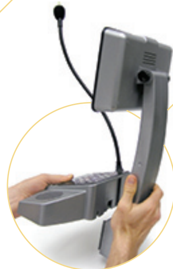
The Series 1500 Video Add-On Display easily converts the Counter Station from Audio-only to Audio/Video.