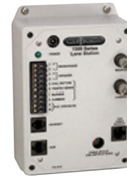
Audio/Video Lane Station