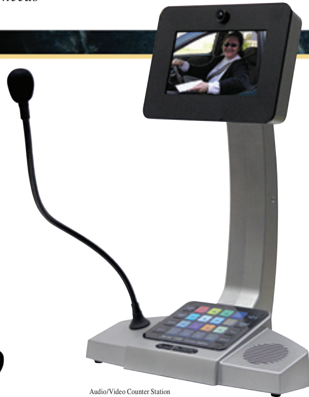
Audio/Video Counter Station