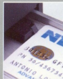
No card, No print.

NBS imprinter innovations geared to market needs are available as options on all models including the unique NBS "No Card, No Print" that prevents imprinting without a card in place. Models can be supplied with a "T&E" dater with 1st line daters available only on certain specialty models.