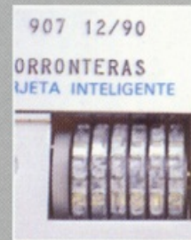
6 Digit dater.