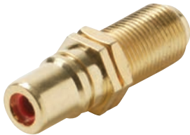
251-507 RCA/F Red – Gold 251-508 RCA/F White – Gold