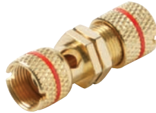
251-509 Binding Post/Banana Red Band – Gold 251-510 Binding Post/Banana Black Band – Gold