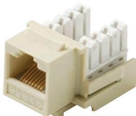
310-120 □ □ RJ45 Almond, Black, Blue, Green, Ivory, Light Almond, Orange, Red, White, Yellow