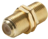
251-503 F – Gold