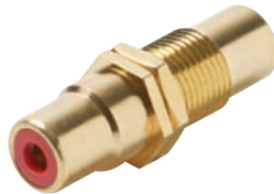
251-505 RCA Red – Gold 251-506 RCA White – Gold