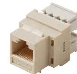
310-110 □ □ RJ45 Almond, Black, Blue, Green, Ivory, Light Almond, Orange, Red, White, Yellow