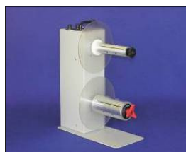
TWIN-CAT-2 with one 1.5" "Quick-Chuck" and one 3" "Quick-Chuck."