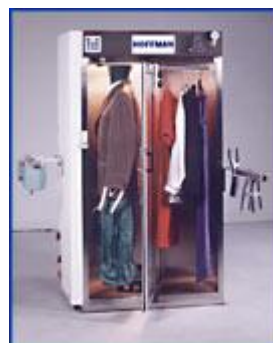
Regal Rotating Cabinet

In conjunction to the above vacuum boards we also offer our complete line of electric boilers in lieu of a central boiler system.