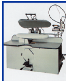
FX - 42SC Self Contained