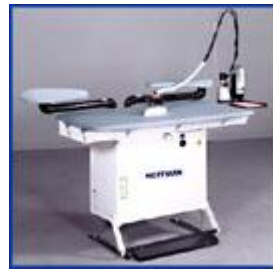
Regency R-51 Rectangular

REGENCY R-51 - Economically priced 25" x 51" rectangular vacuum board complete with thermostatically controlled heated pressing surface, powerful built-in vacuum, adjustable air volume control lever, adjustable height, interchangeable foot pedal for right or left hand operation. This is the perfect table for shirt finishing, underpressing of small parts and touchups of all garments.