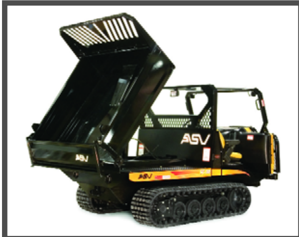
1.3 yd 3 Hydraulic Dump Box Option