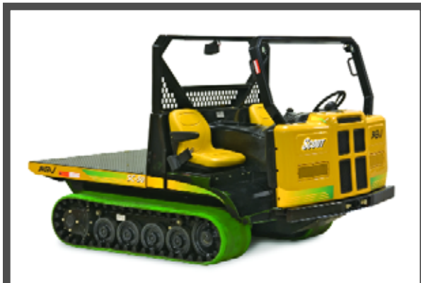
Turf Edition with Smooth Tracks