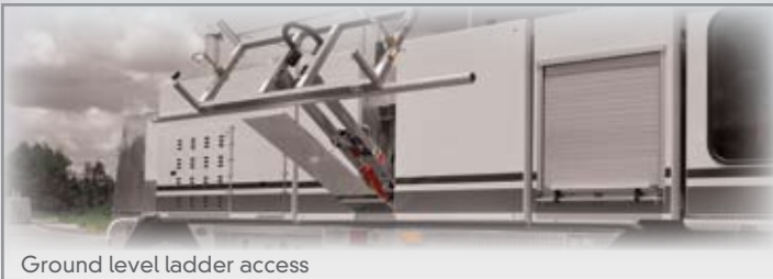
Ground level ladder access