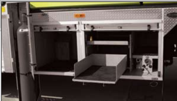
Recessed propellant lift and spacious lower compartments