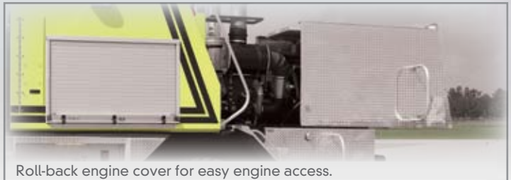
Roll-back engine cover for easy engine access.