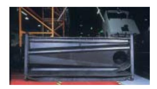
A choice of two sweeping heads is offered on the A9000 model.

The Schwarze sweeping head design is one of the keys to the A9000's superior sweeping ability.