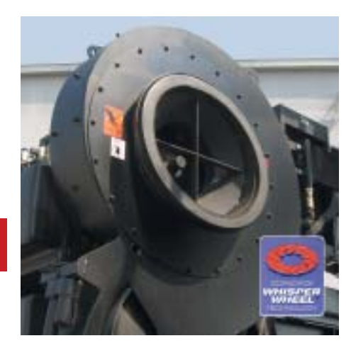
The Schwarze-Exclusive WhisperWheel<sup>SM</sup> Fan System

This 'inboard agitation' by the steel gutter brooms removes an increased amount of compacted material from the roadway. The Schwarze GEO <sup>SM</sup> system ensures excellent transfer of debris to the suction tube even in very heavy debris conditions.