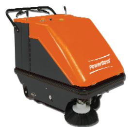
Collector 37 Walk-Behind Sweeper 45,000 sq.ft. per hr (4,180 sq. m.) 34" Sweeping path (86cm) Large 2.5 cu.ft. hopper Battery or Gasoline Powered

Collector 36 Walk-Behind Sweeper 36,600 sq.ft. per hr (3,400 sq. m.) 34" Sweeping Path (86cm) Large 1.66 cu.ft. hopper Battery Powered