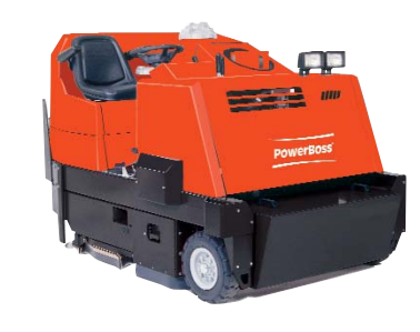
Monitor 82 & Monitor 90 Double Scrubbers

Up to 77,500 sq. ft. per hr (7,200 sq. m.) * 42" - 60" Sweeping Path (106 - 152cm) 42" - 48" Scrubbing Path (106 - 152cm) 68 - 100 Gal Solution Tank (257 - 379 L) 65 - 100 Gal Recovery Tank (246 - 379 L) Disc or Cylindrical Brush Available Gasoline, Diesel or LP Powered *spec based on 90