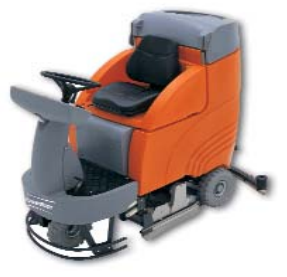
Admiral 30 & 32 Rider Scrubber 51,666 sq.ft. per hr (4,800 sq. m.) 28" & 30" Scrubbing Paths (71/76cm) 30 Gal Solution/Recovery Tanks (116L) Disc or Cylindrical Brush Deck Battery Powered