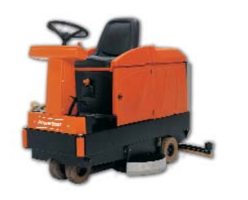
Admiral 36 Rider Scrubber 57.000 sq.ft. per hr (5.300 sq. m.) 35" Scrubbing Path (88cm) Battery Powered