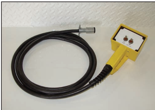
Tethered remote is removable for easy storage.