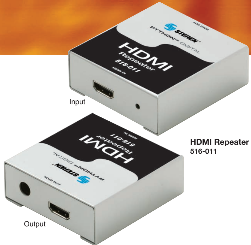
HDMI Repeater 516-011