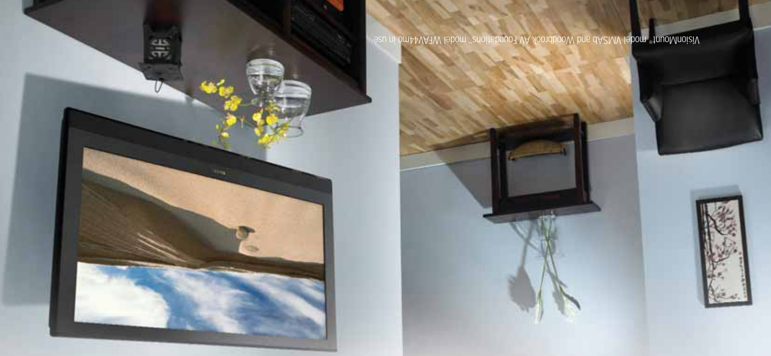
VisionMount® model VMSAb and Woodbrook AV Foundations™ model VFAV44mo in use

The second concept is not really a "standard" at all. Rather, TV manufacturers who do not follow the VESA standards place their mounting holes on the back of their TV in non-conforming places. For these TVs, Sanus makes "universal" mounts. This means that there are brackets that can be adjusted back and forth to properly align the many mounting holes. When mounting a TV with a random hole pattern, in addition to choosing a "universal" mount, it is critical to also compare the weight of the TV to the weight rating of the mount.