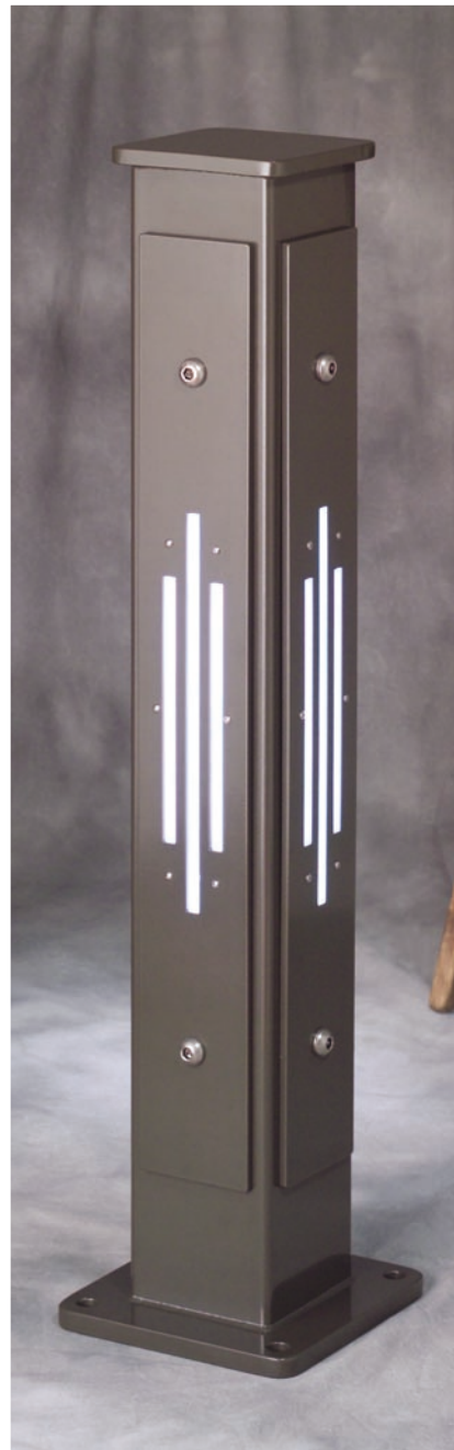
Cool Touch™ B-6-L LED lighted bollards

All designs shown incorporate the iLight patented Plexineon® LED light source. Plexineon is protected under U.S. Pat. No. 6,592,238 and “ iLight ” and “ Plexineon ” are Registered Trademarks of iLight Technologies, Inc., Evanston, Illinois