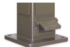
Available with optional power outlet