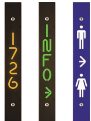
(optional custom LED Lighted Signage Panels)