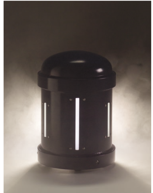
B-1, 8" LED Lighted Post Top Beacon

Electrical Input standard 120v line (Input range 100 Vac ~ 240 Vac/0.3/A (Low Voltage 24 Volt/20 Watt Transformer). Most applications will come standard with 6 - 4" LED Plexineon® Bright White.