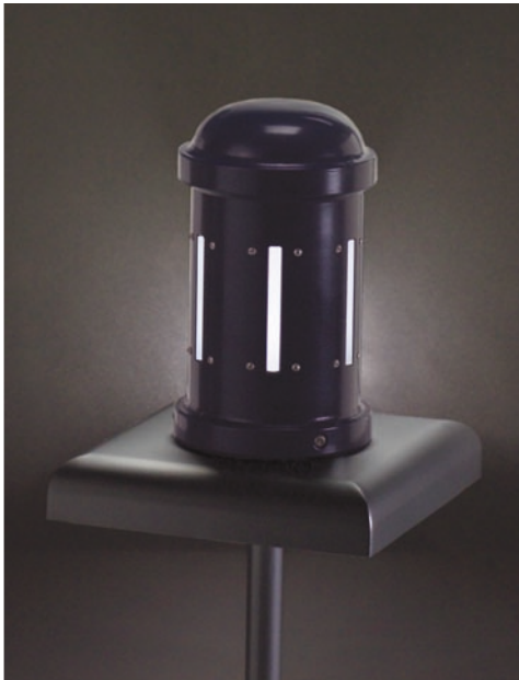
B-1, 6" LED Lighted Post Top Beacon

Candela, Lumens & Utilization are available in Standard IES Files.