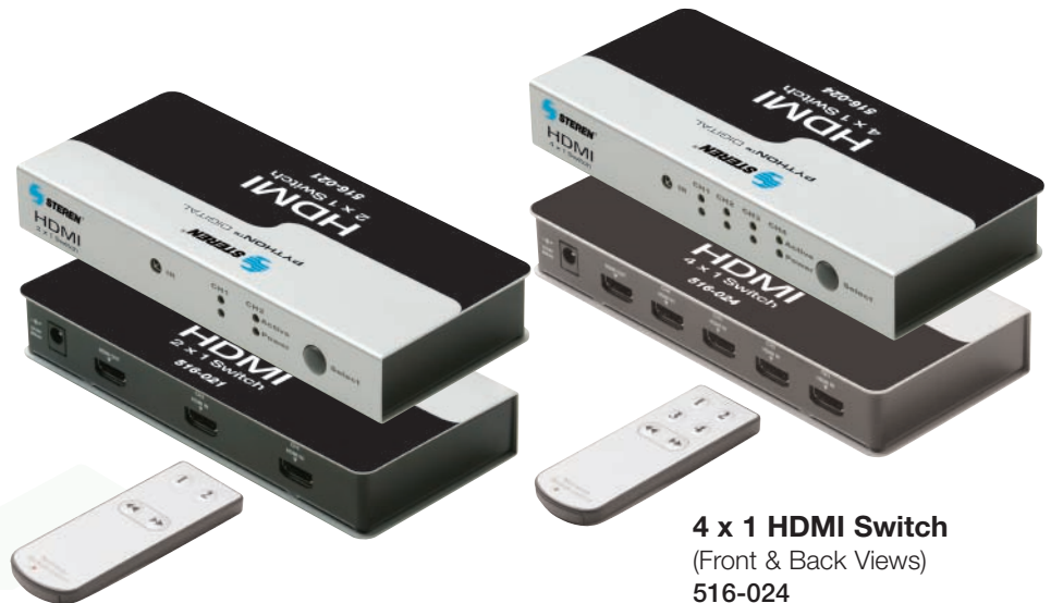
2 x 1 HDMI Switch (Front & Back Views) 516-021