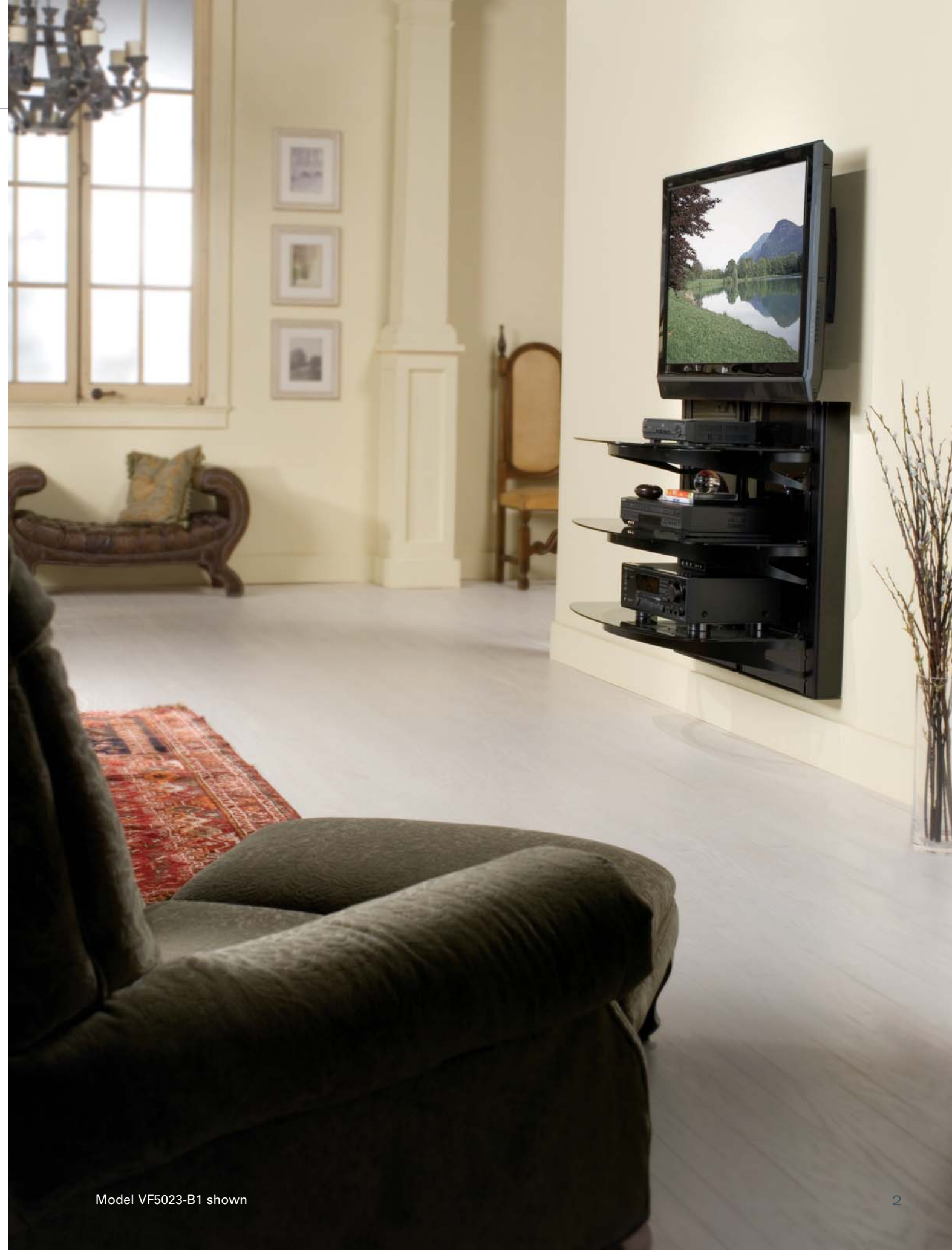
Model VF5023-B1 shown