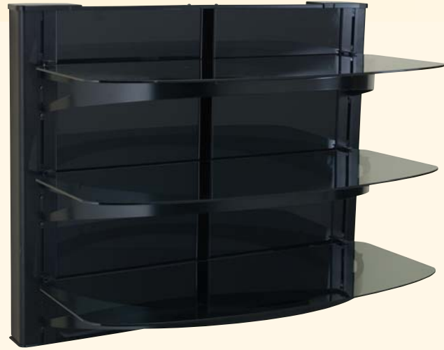
Model VF5023-B1 shown