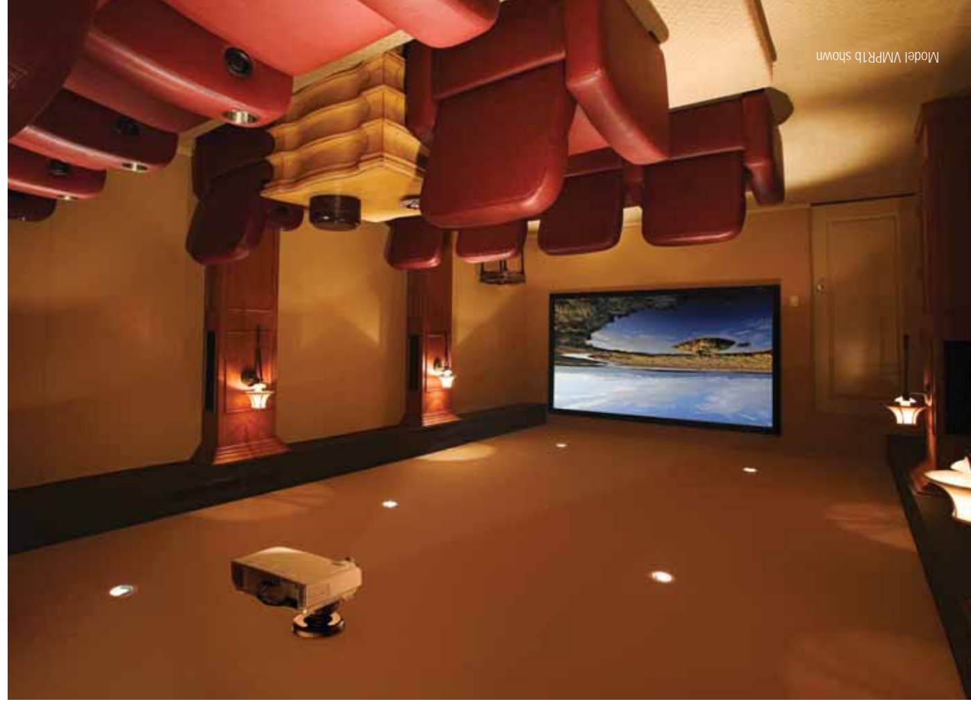
Model VMPr1b shown