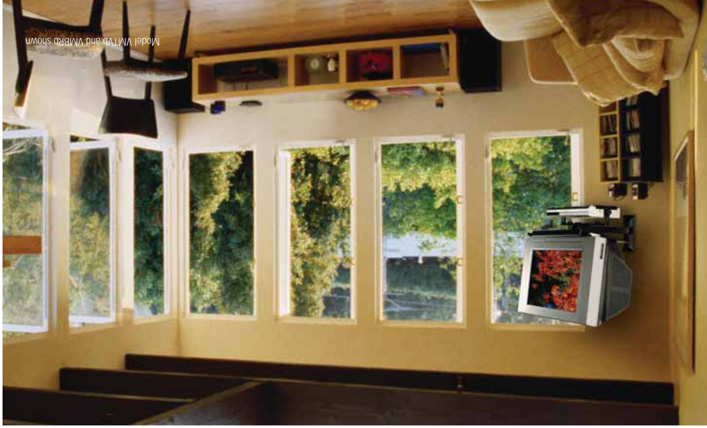
Model VMTvb and VMBRb shown