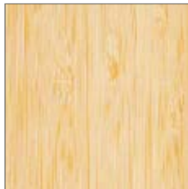
Vertical Grain Natural FLTGN008