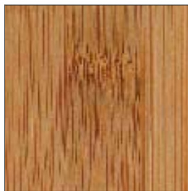
Flat Grain Carbonized FLTGN005