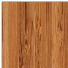
Vertical Grain Carbonized FLTGN007