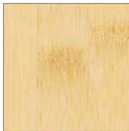
Flat Grain Natural FLTGN006