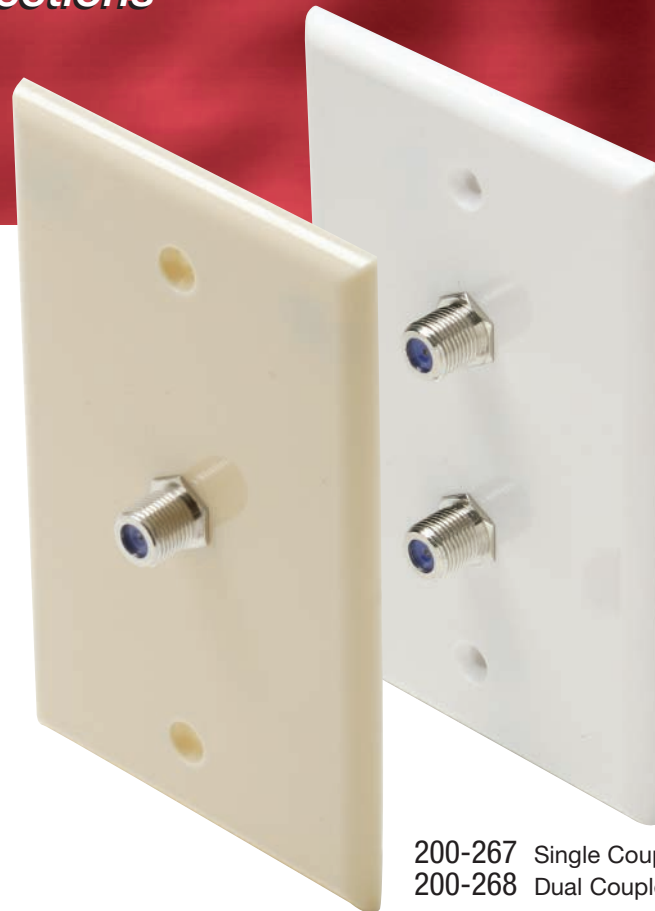
200-267 Single Coupler 200-268 Dual Coupler