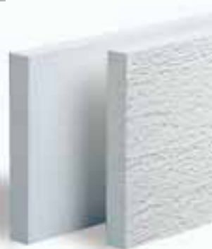
Trimboards, corners, and sheets available in Smooth and TrueTexture woodgrain finish.