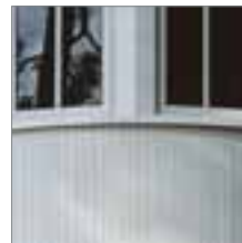
Trimboards, Sheets, Corners, Beadboard, Brickmould, Drip Cap and more...

Restoration Millwork™ cellular PVC trim makes an authentic statement on your home. Available in smooth and realistic woodgrain TrueTexture™ finish in a wide variety of traditional and specialty profiles – you can also mill it or paint it to create custom designs.