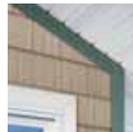
Single 7" Straight Edge Rough-Split Shakes in natural clay and Cornice Molding in ivy green with colonial white 3-1/2" Lineals.