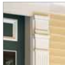
Window & Door Casings, Panels, Detailed Millwork and Special J-Pocket Accessories for Vinyl Siding