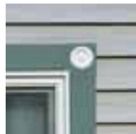
3-1/2" Lineals in ivy green with Corner Block and Rosette.

To enhance the look of wood on your home, Northwoods is complemented by a complete line of wood-like decorative trim. From cornerposts and window casings to frieze boards and gable trim, CertainTeed has replicated the look of wood so that your home will have the natural, hand-crafted appearance that we call Vinyl Carpentry™. And, without the worry or expense of frequent maintenance.