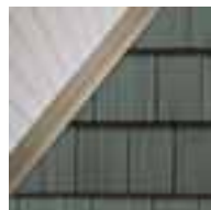
Cornice Molding with Single 7" Straight Edge Rough-Split Shakes and Vinyl Carpentry Triple 2" Beaded Soffit.