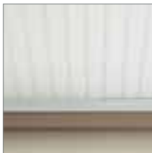
Beaded Triple 2" Panel with Soffit Cove Molding