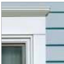
5" Lineal with Crown Molding