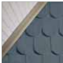
Cornice Molding with Cedar Impressions Half-Round accents and Vinyl Carpentry Triple 2" Beaded Soffit