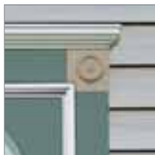
3-1/2" Lineal with Crown Molding, Corner Block and Rosette