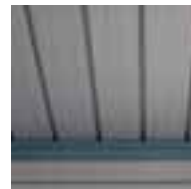
Vinyl Carpentry Ironmax™ Soffit with Cornice Molding.