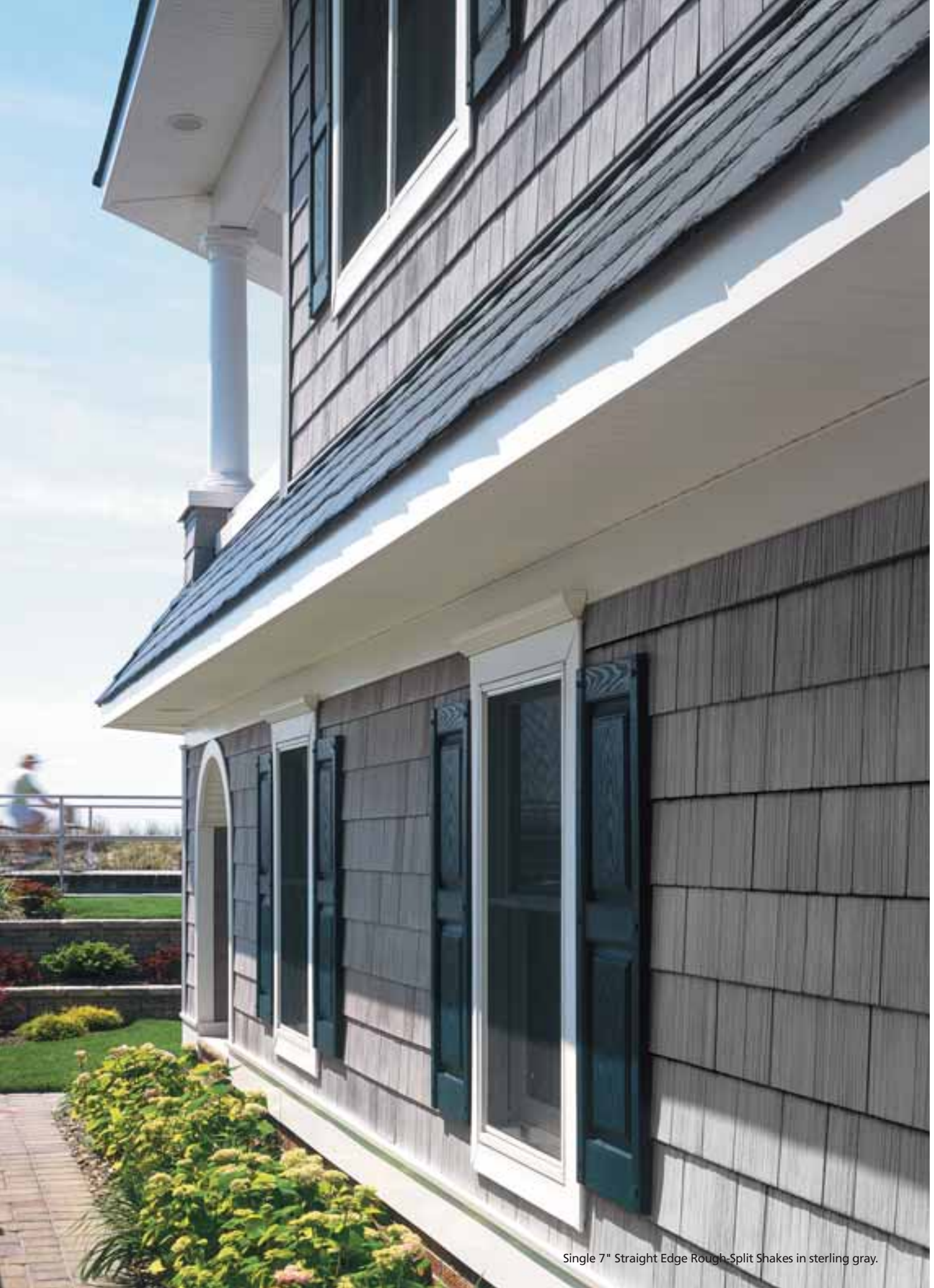
Single 7" Straight Edge Rough-Split Shakes in sterling gray.