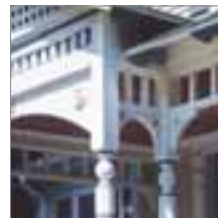
Column enclosures, Soffit, Fascia or Custom Milled Designs