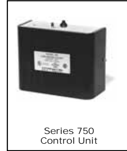
Series 750 Control Unit