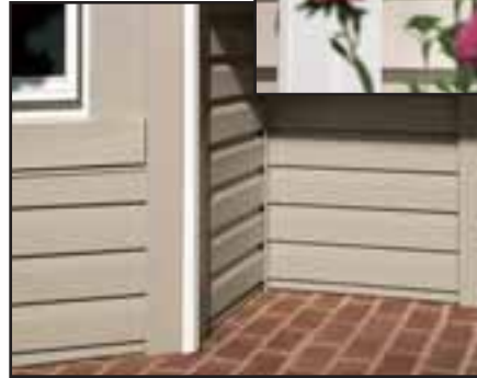
Double 4-1/2" select cedar dutchlap in natural clay with 4-Piece Corner System in natural clay with colonial white insert