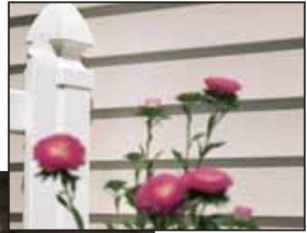
Double 4" select cedar clapboard in silver ash