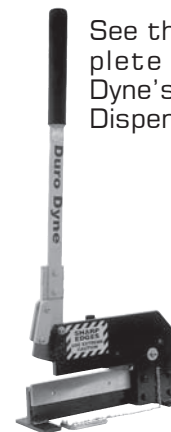
ITEM# 43010 FDCCS-10

See the reverse side for complete information on Duro Dyne's Flexible Duct Connector Dispenser Shear.