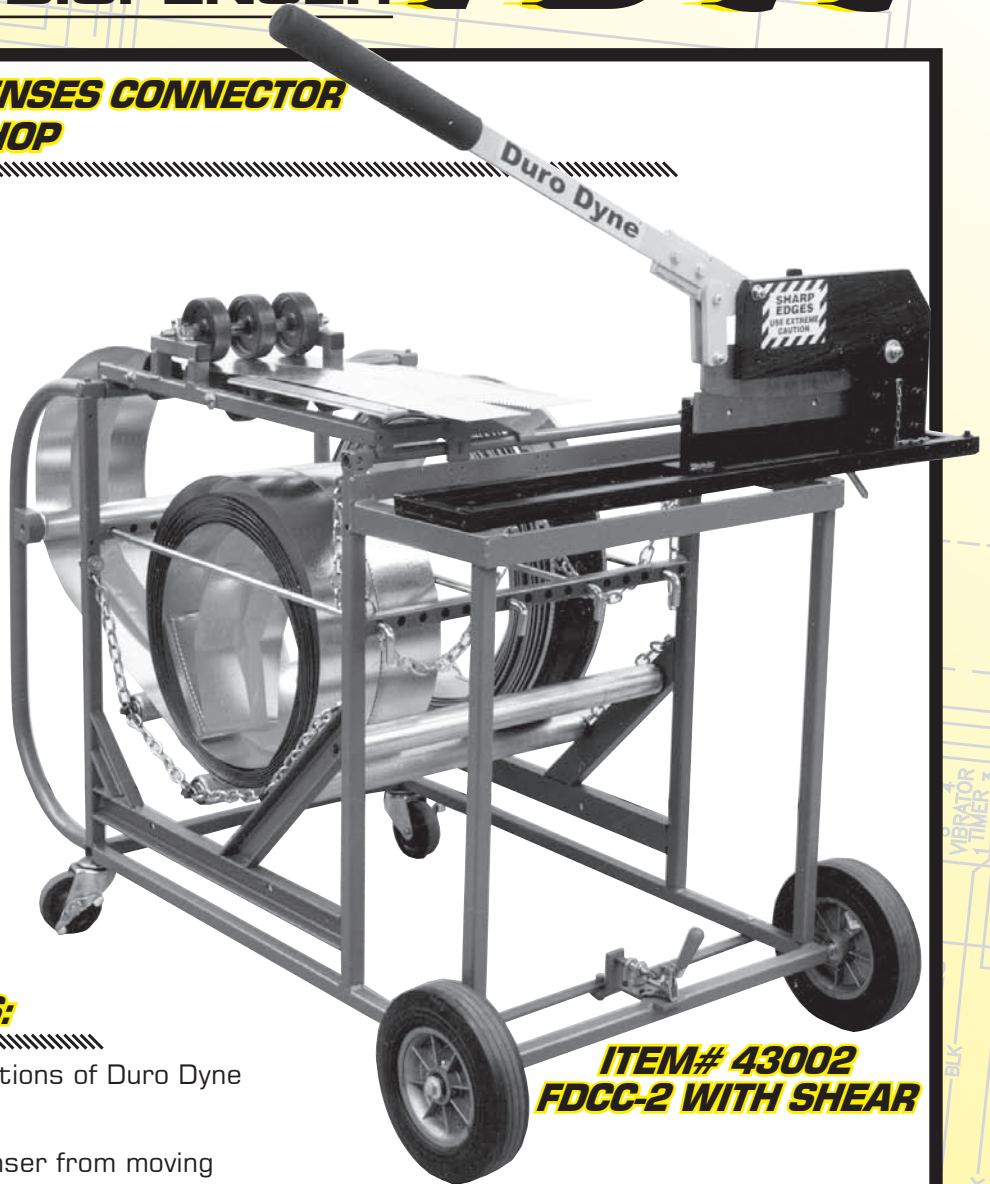
ITEM# 43002 FDCC-2 WITH SHEAR

Duro Dyne's Model FDCC-2 keeps up to three rolls of flexible duct connector or vane rail within easy reach, anywhere in the shop. Full swivel casters make movement around the shop possible, and ball bearing rollers quickly dispense connector with a simple pull. A foot actuated brake locks the FDCC-2 in place when dispensing the connector. The shear attachment cuts the duct connector accurately and effortlessly.