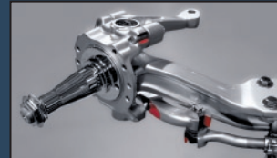
Up to 55-degree wheel-cut for added maneuverability on model 2 and 3.