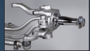
Up to 45-degree wheel-cut for added maneuverability on model 5.