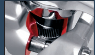
Needle bearings replace bushings for greater reliability.