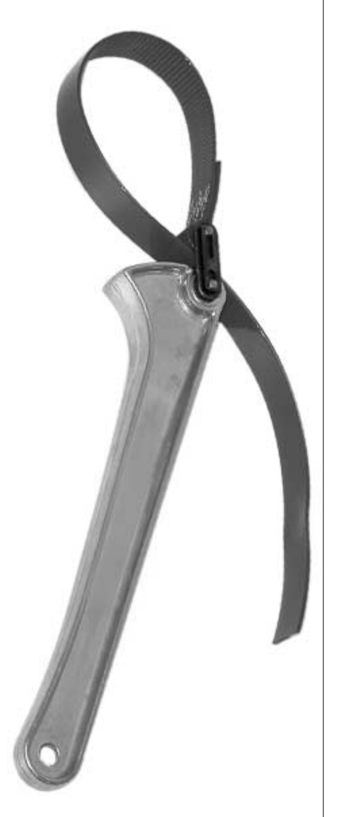
The Sloan Strap Wrench is ideal for use with Sloan's Optima™ Plus