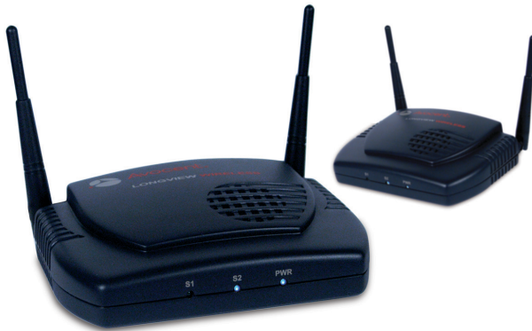
LV3500W Transmitter and Receiver

The LongView wireless extender includes a wireless transmitter and receiver, power supplies, and audio cables. The LV3500W transmits data 150 feet (46 meters) through walls and up to 300 feet (91 meters) line-of-sight.