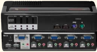
SwitchView Multimedia switch

The all-in-one SwitchView MM (Multimedia) desktop KVM switches let you switch between USB or PS/2 systems, share your USB devices and control multimedia applications. With one SwitchView Multimedia switch, you can control multiple PCs and share access to your USB devices: digital camera, CD-ROM, PDA, scanner or printer. The SwitchView Multimedia KVM switches are available in 2 and 4 port models, with USB 1.1 and USB 2.0 support.