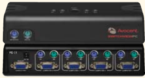
SwitchView PC switch

The Avocent SwitchView PC KVM desktop switches let you control up to four PS/2 computers from one keyboard, monitor and mouse. Lighted LED indicates which computer you are accessing and audible indicators confirm channel switching. With color-coded cables for easy installation, customizable channel selections and error-free boot-up, the SwitchView PC switch offers you a complete desktop KVM solution.