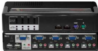
SwitchView Multimedia switch