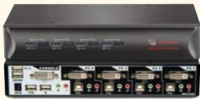
SwitchView DVI switch

The SwitchView DVI (Digital Visual Interface) KVM switches feature 1920 x 1200 video resolution and deliver crisp images for your high-end displays and flat panel monitors. The versatile SwitchView DVI KVM switch is available in 2 and 4-port models. It easily manages up to four USB DVI computers from a single USB keyboard, mouse and DVI monitor.