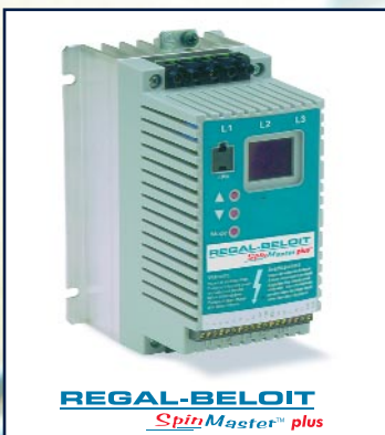
REGAL-BELOIT SpinMaster™ plus

When additional features are required such as load, speed or frequency scaling, analog output signals and communication, the full featured SpinMaster™ Plus offers exceptional performance at an affordable price. The SpinMaster™ Plus has eighteen isolated inputs and outputs including start, stop, 0-10 VDC input, 4-20 mA input, 10 VDC supply for external potentiometer, and a 12 VDC supply for an external relay. Additional options include a 1000 Hz output frequency option for very high speed applications and PI control for process applications.