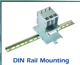
DIN Rail Mounting

The SpinMaster™ AC drive, depending on the drive series selected, has a horsepower range from 1/4 to 25 horsepower in 120 VAC, 208/240 VAC, 480 VAC and 575 VAC, single phase input, single or three phase input, and three phase inputs. A rugged convection cooled or heatsink fan cooled IP20 enclosure with finger safe terminals offers an advantage to the OEM or panelbuilder. An optional DIN rail mounting system provides additional flexibility in maximizing panel space.