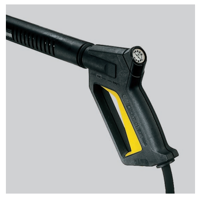
Ergonomic trigger gun with built-in pressure gauge and automatic shut-off when trigger is released