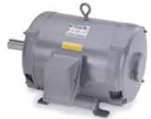
Oil Well Pumping