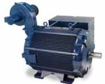
Dripproof Force Ventilated