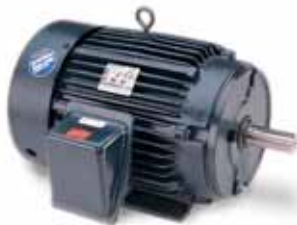
IEEE45 USCG Marine Duty