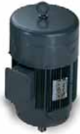
Vertical Solid Shaft