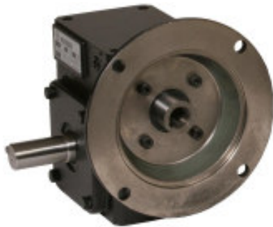
C Flange Input - Shaft Output Left Or Right Hand Output