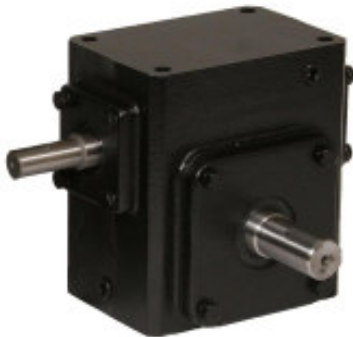
Shaft Input - Shaft Output Left Or Right Hand Output