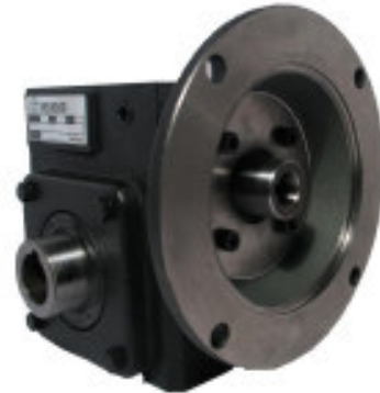
C Flange Input Hollow Bore Output