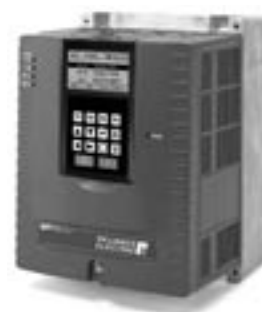
SP600 Shown with LCD OIM