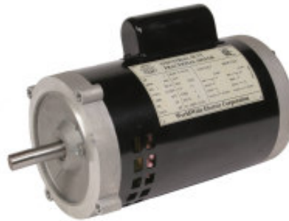
Jet Pump Motors