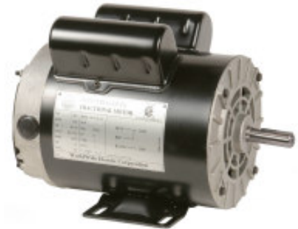
Compressor Duty Motors