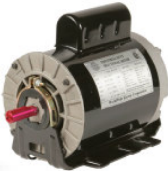
Resilient Mount Motors