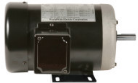
56 Frame Motors