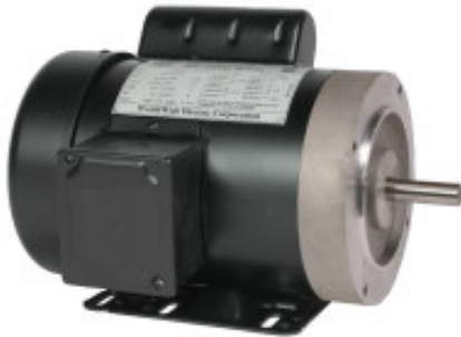
56C Flange Motors

General Purpose Motors Special Purpose Motors