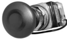
2 Position Push Pull With Fully Illuminated Mushroom Head