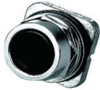
Flush Pushbutton Operator