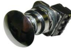
2 Position Push Pull Operator