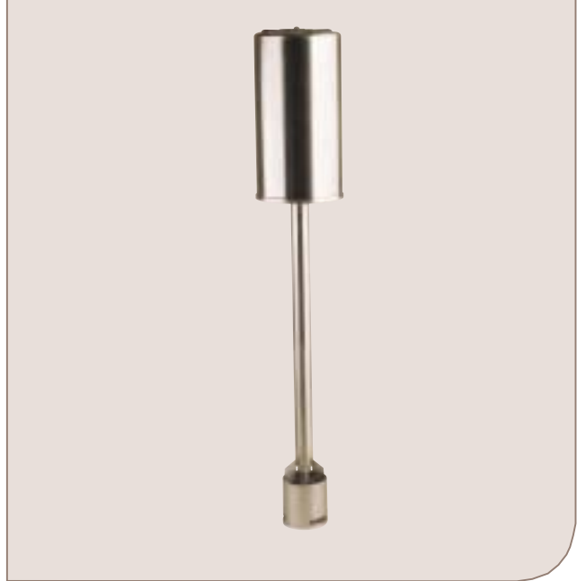
Fig. 1. LKRE, Agitator.

The specially designed jet-pipe around the propeller (fig. 1) produces concentrated sucking and squirting actions which lead to an effective mixing.