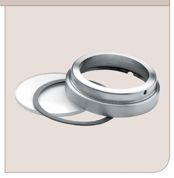
Fig.1. LKS 105, Tank sight glass.