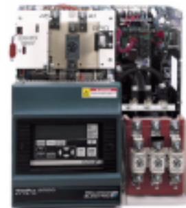
WebPak 3000 40-75 HP at 230 V 75-150 HP at 460 V