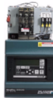
WebPak 3000 1.5-30 HP at 230 V 3-60 HP at 460 V